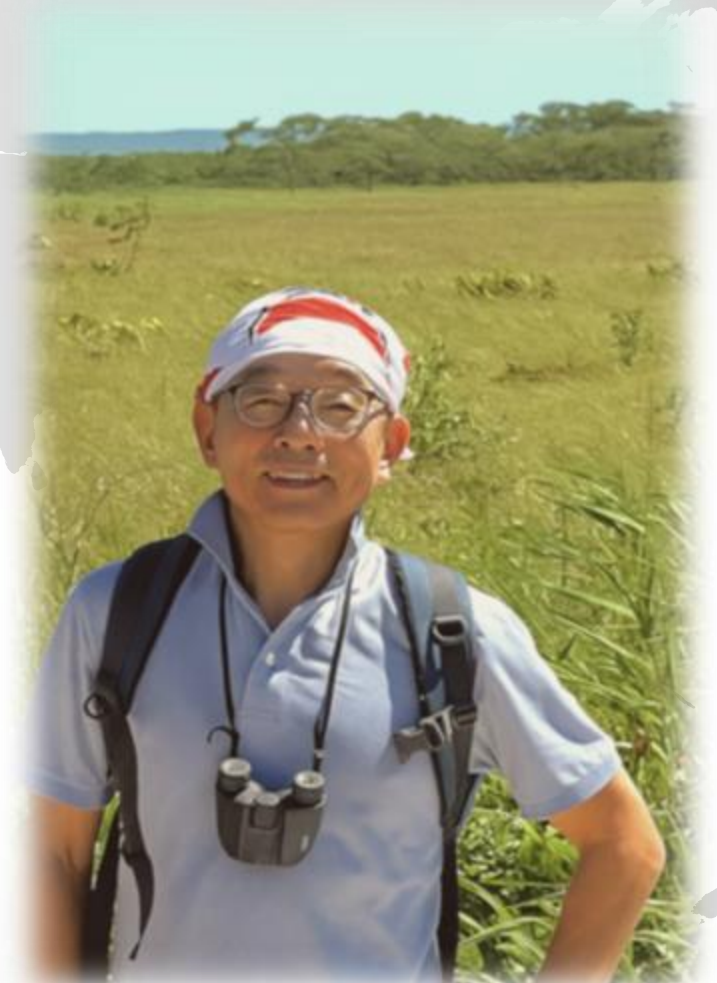
Field research in Shiretoko World Natural Heritage Site