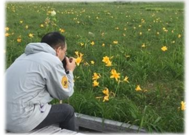
At Sarobetsu Mire National Park