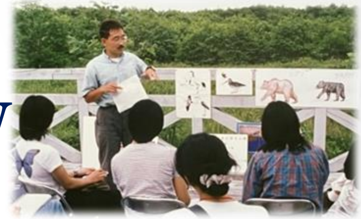
Interpretation Program at Kushiro Wetland National Park