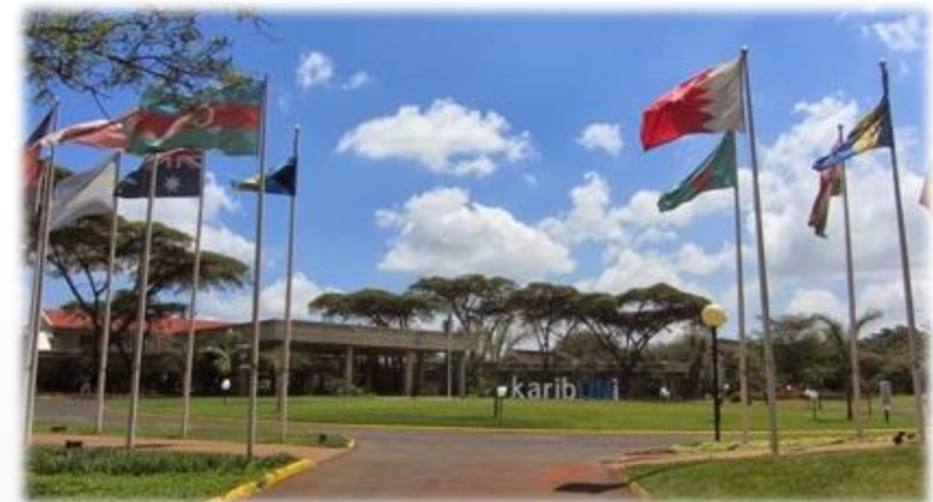
UNEP Headquarters in Nairobi