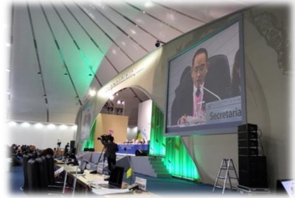
CBD COP12 in Pyeongchang, Republic of Korea