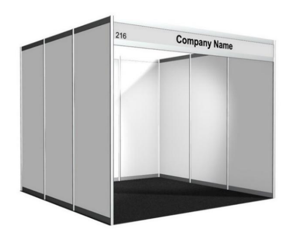
Size – 6sqm

Note that the visuals below are for information purposes only. Listed equipment may vary slightly.